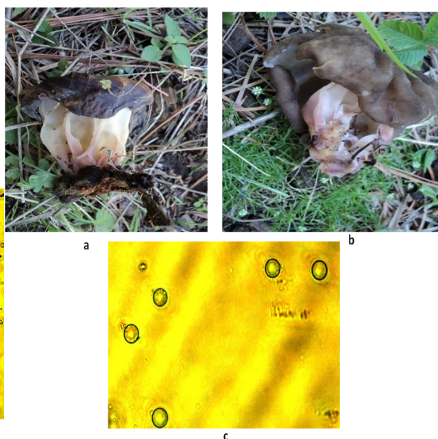
Figure 2: a,b-Fruiting body of Gyromitra sphaerospora , c- Spores (400x) of Gyromitra sphaerospora .

Edibility: May prove fatal when eaten raw but can take after cooking.